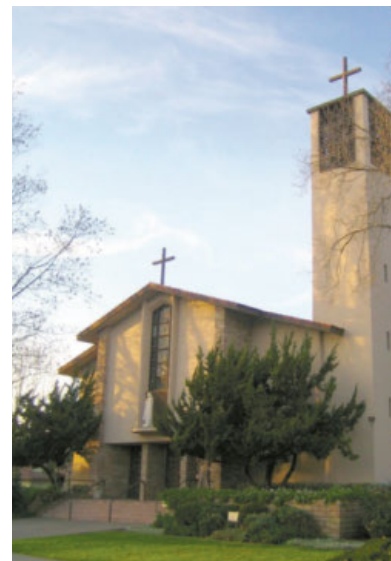
2323 Montgomery Dr. Santa Rosa, CA 95405

Saint Eugene's Cathedral Parish, under the leadership of the Bishop of Santa Rosa, is a community of people united through faith, worship, and service. As disciples, we are empowered through grace to proclaim and explore God's word, to celebrate the mysteries of His redemptive action in history, to honor the traditions of the Catholic Church, to foster personal spiritual growth, and to promote fellowship within and beyond our parish. As members of civil society, we are instruments of peace, justice, reconciliation, and service to others.